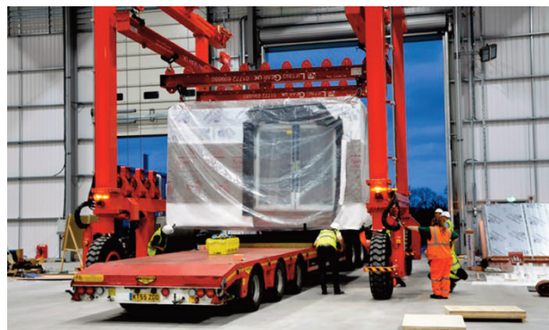
Fig. 3 - Transport operation of a façade component, all factory-assembled.