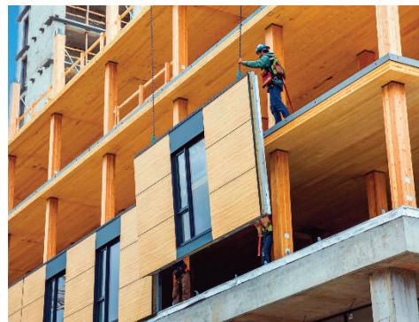
Fig. 4, 5 - Building site as ‘assembly’ place; Prefab housing module, just before to be ‘plugged’.